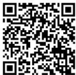
Passions, Abilities, and Talents Assessment

See Appendix A on page 19 for the Abilities & Talents Assessment.