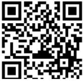
Spiritual Gift Survey

See Appendix S on page 7 for an example of the Spiritual Gifts Discovery Survey.