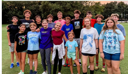
Students at Largo Park last Sunday.