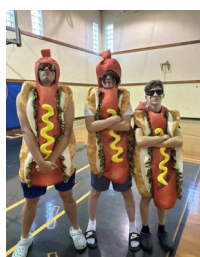
Students had lots of fun dressing up and competing in games at this year's Fall Fest