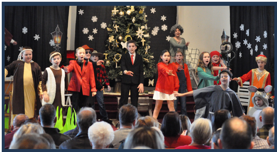
The cast of "Christmas Eve."