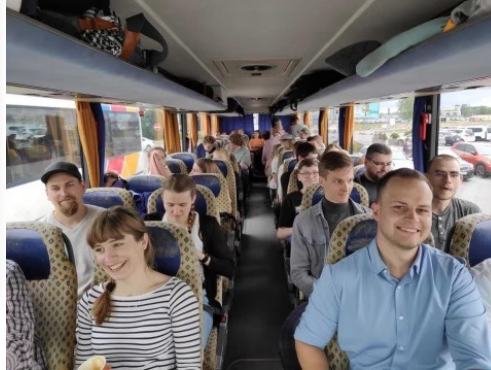
Corpus Christi attendees bussing to Liepaja, Latvia.