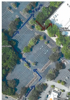
Toddler Drop Off