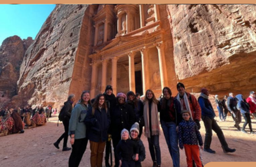
Photo: the view of the Petra valley

In February, our cohort traveled to Jordan for a Mid-Year Retreat. We left on February 15th, my 23rd birthday! While a full day of travel that included a border crossing was not the most restful way to spend a birthday, arriving in Wadi Musa/Petra and seeing the beautiful mountains was such a special way to celebrate my birthday! Our week in Jordan was filled with moments of exploration, rest, and reflection. We focused on the theme of "Identity" as we journeyed around Jordan, looking at both our identities and those of the people of Jordan, especially the large refugee population. We had the opportunity to visit the Za'atari refugee camp that hosts around 80,000 people, the majority being refugees from Syria. Overall, it was a memorable trip!