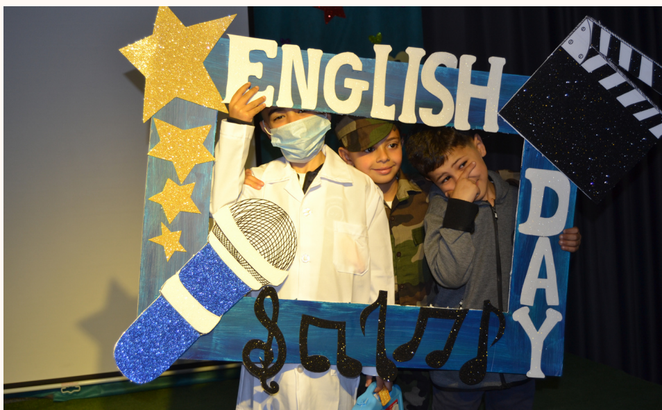
Photo: 1st grade students on English Day at the School of Hope; the 1st graders gave presentations on their future jobs and some chose to dress up

I want to express my immense gratitude for my partners near and far for supporting me! Thank you to the ELCA, the ELCJHL, my sending community, and the congregations at St. James Lutheran Church in Johnston, IA and Bethany Lutheran Church in Rice Lake, WI for your blessings and prayers!