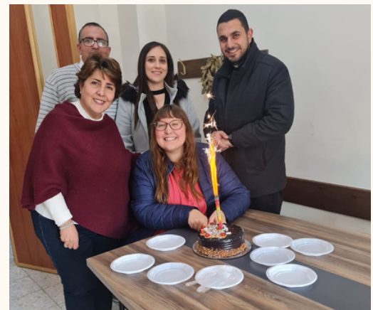
Photo: the administration at the school surprised me with a birthday cake (it was delicious!)