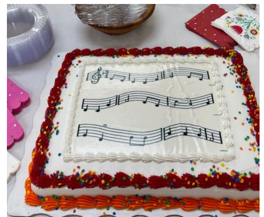
Even the cake was all about the piano!