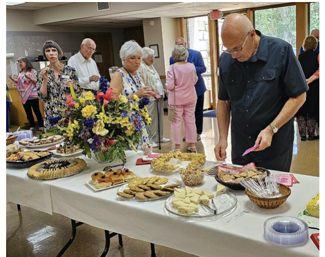
Kirk cooks went all out to please concert goers and the artist.