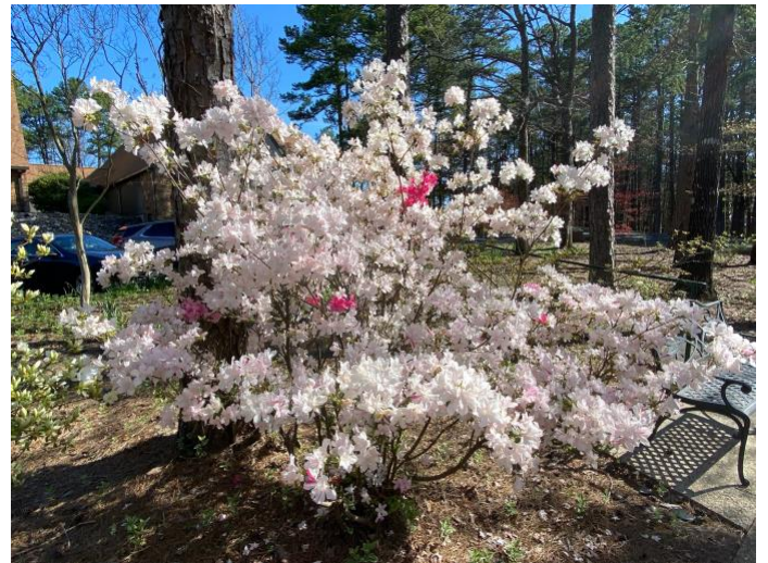
White azalea.

Spring 2024 is a benchmark year for our Kirk gardens following several hard winters and brutal summers. In sequence we've witnessed exuberant blooming of our favorite bulbs, trees, and shrubs. Beginning with daffodils, flowering quince, forsythia, and redbud trees we've welcomed the best spring in years for our many azaleas. And finally, our cherished pink dogwood is in full bloom outside the front entrance to the sanctuary. Enjoy these photos but hurry to the gardens to see the spectacle for yourselves.