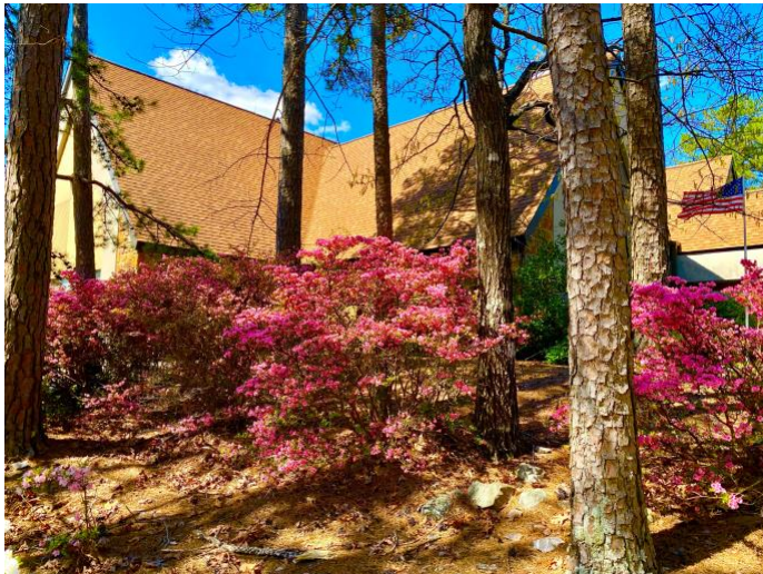
Pink azaleas.