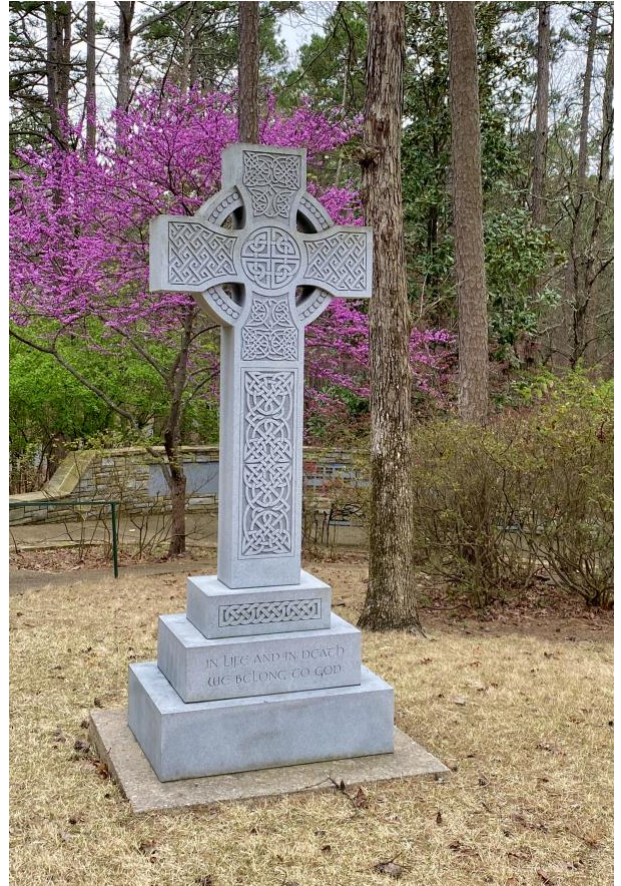
Celtic Cross, Memorial Garden, March 2024

The Kirk has many strengths. The preaching has been outstanding. The music is superb and identified by members and visitors as special. Half of our existing members are here because another member invited them to