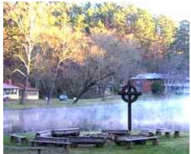
Celtic cross at Ferncliff camp.