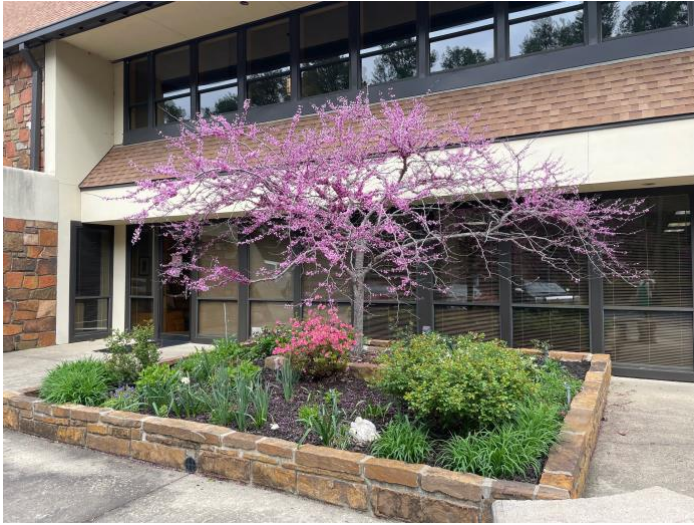
Redbud tree.