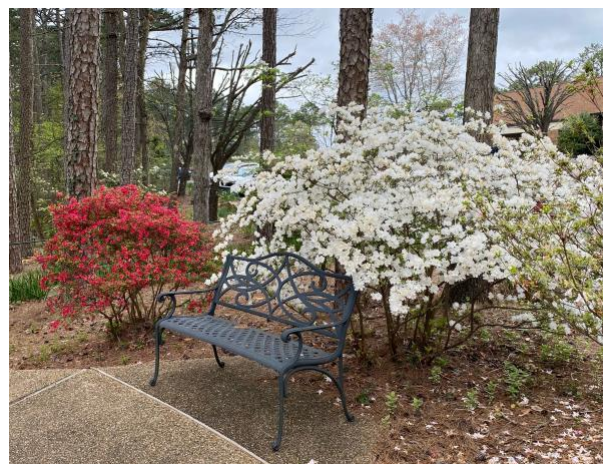
White and red azaleas.