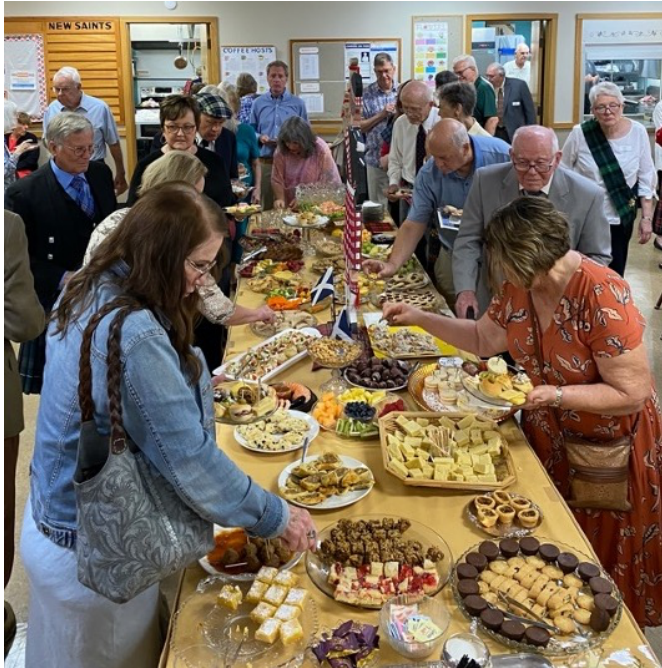
An extravagant high tea was held in Hoffius Hall following the service, all provided by Kirk members and friends.