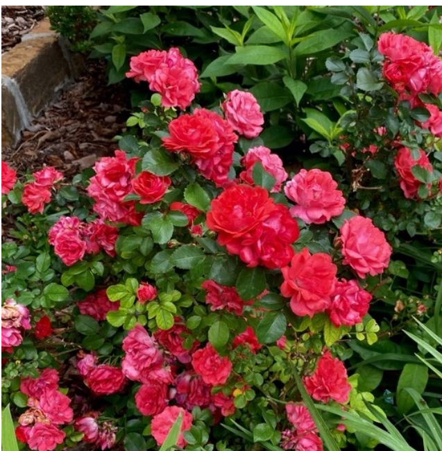
Memorial Garden roses.

Her infectious smiles and laughter, incredibly generous spirit and compassion for others will also be missed by many close friends and acquaintances. A memorial service was held at Presbyterian Kirk in the Pines Church, 275 Asturias Dr, Hot Springs Village, AR, on May 7 at 2 pm in the Memorial Garden with a small reception following. Funeral service will be held at Eastwood Church of the Brethren, 581 Darrow Rd, Akron, OH, on May 27, 2023, at 12 noon. Interment will be at Tallmadge Cemetery.