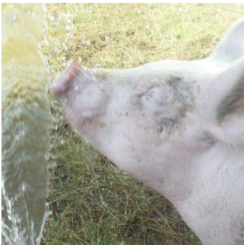
LuLu the pig

Provided by Vera Lloyd Presbyterian Family Services