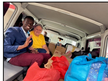
Transporting medical equipment.

The second grant to the Network provides $3,000 to send six Southwest Diocese orphans to Advance Level Secondary School. These are the first students from the Diocese orphanage to graduate from Entrance Level Secondary School and move on to the Advance Level.