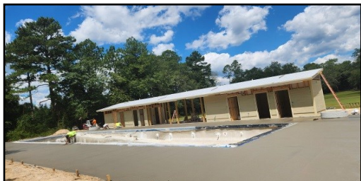
Camp Kinard's new pool and bathhouse.