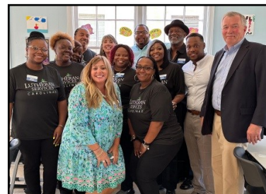
Lutheran Services Carolinas Staff

Lutheran Services Carolinas started a Transitional Youth Day Services Program this summer. Located next to Reformation Lutheran Church, Columbia, the program serves youth in DSS custody awaiting foster care placement. The program provides a safe, structured environment where up to 24 youth can receive academic help, counseling, and recreation. DSS funds the building and staff costs; the Foundation's $3,000 grant will be used for recreational/educational supplies and activities not covered by DSS.