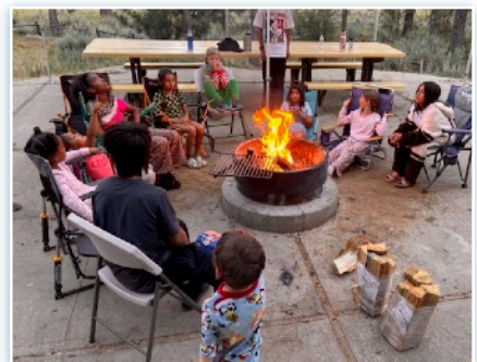
CityKids Family Camping Trip