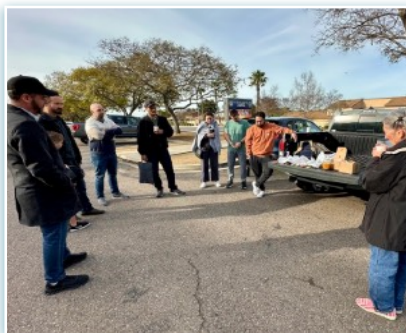
Sunday Setup Team Morning