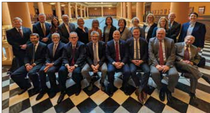
Bankruptcy judges from around the nation traveled to New York City to help judge the Duberstein Competition.