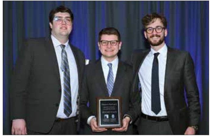
The team from Wake Forest University School of Law won second place in the competition.