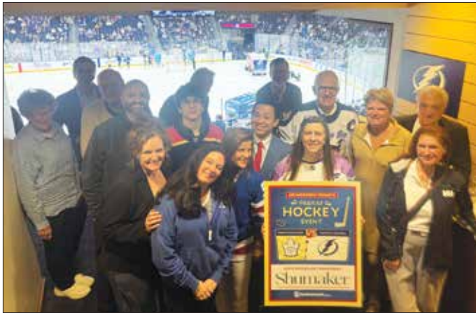
ABI Endowment supporters enjoyed a private suite at Benchmark International Arena in Tampa, Fla., to watch the Tampa Bay Lightning take on the Toronto Maple Leafs.