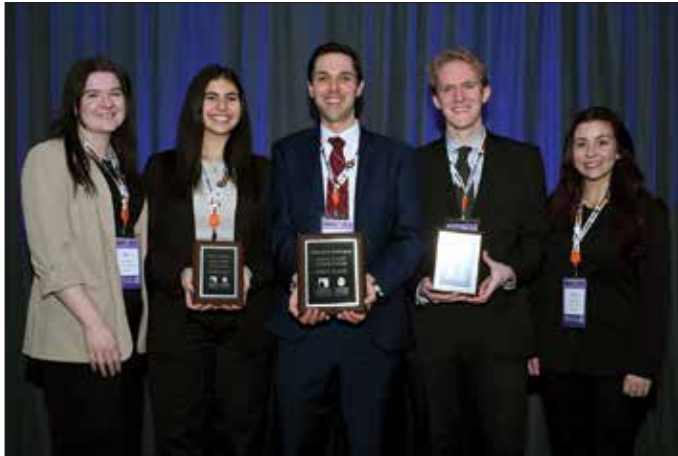
The team from the University of Illinois College of Law clinched First Place at the 34th Annual Conrad B. Duberstein National Bankruptcy Moot Court Competition.