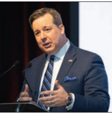
Broadcast journalist Ed Henry (above) discussed his book, 42 Faith: The Rest of the Jackie Robinson Story , which highlights the life of the Dodgers legend.