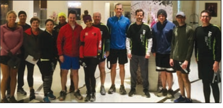
The brave and hearty participants of the Fun Run. The weather wasn't as brisk as their pace! The entire group averaged under nine minutes a mile for the course of nearly four miles.