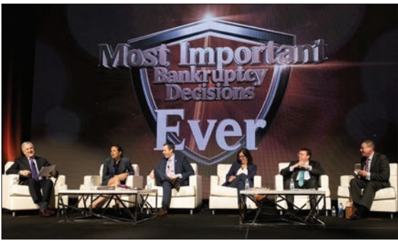
Two popular panels discussed the most important bankruptcy cases (above) and the growing role of artificial intelligence in bankruptcy practice (below).