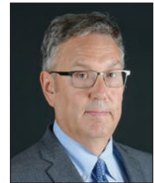
James B. Angell