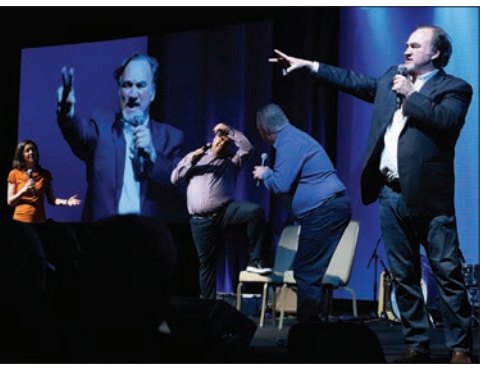
The Final Night Dinner featured the comedic stylings of legend Jim Belushi with his Board of Comedy.