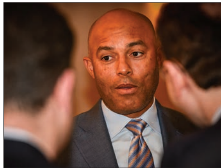
Former New York Yankee Mariano Rivera and his foundation teamed up with the ABI Endowment Fund to benefit Puerto Rico.

Former New York Yankee legend Mariano Rivera and his family foundation joined with ABI to benefit Puerto Rico relief on April 4. The event was held at the famed New York Athletic Club on Central Park South. The Rivera Foundation