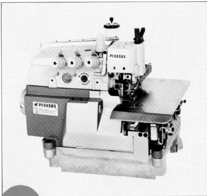
E32L Safety Stitch Machine

Offers double The productivity when used in conjunction with normal machines.