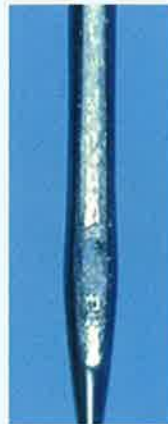
[Upper thread breakage]