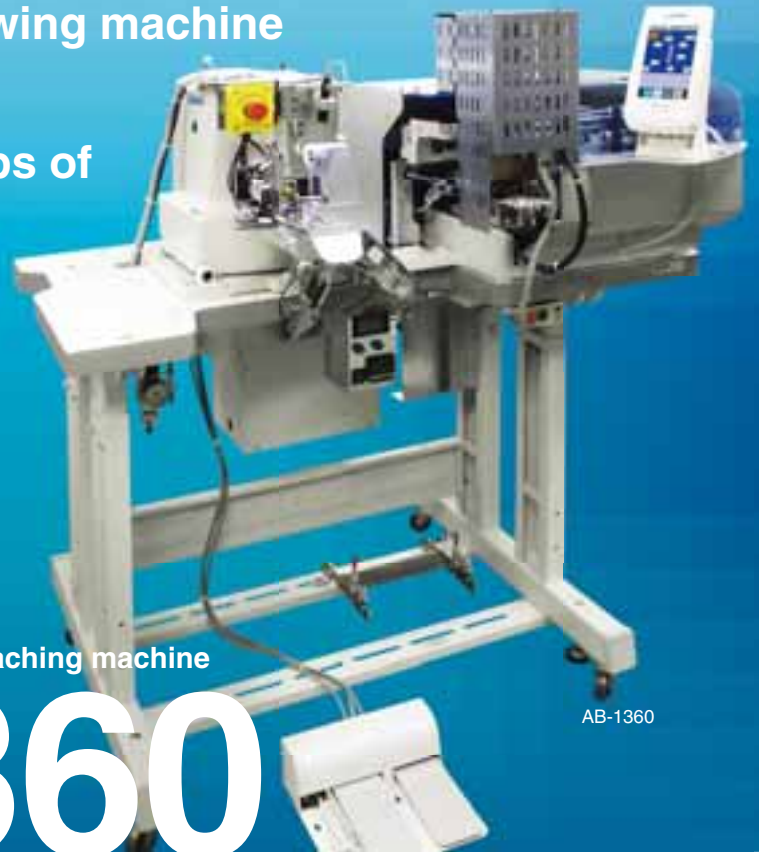
Automatic 1-needle shoelace loop attaching machine

This is the automatic sewing machine which is ideally suited for sewing shoelace loops of sports shoes.