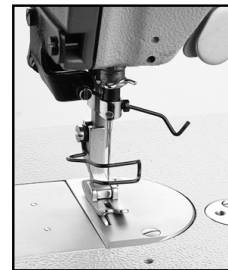
Thread wiper system