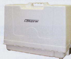
Comes with hard plastic carrying case. (20.75" x 13.5" x 10")

Specifications subject to change without notice.