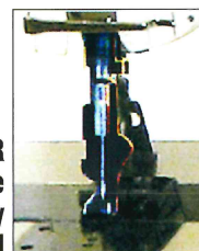
744R Needle Assembly Detail