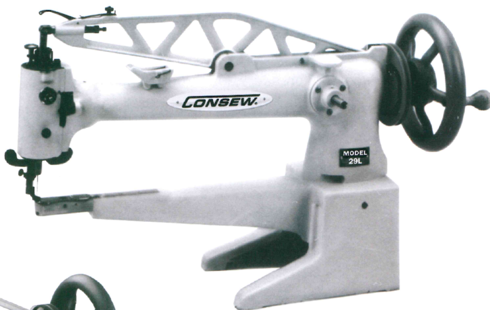
Long Arm Version Model 29L Model 29BL -large bobbin