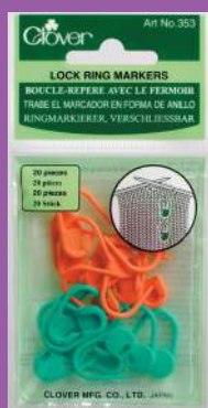
Art No 353

Rnd 13- 25: 1 sc in each st around (42). Fasten off, using darning needle to weave in ends