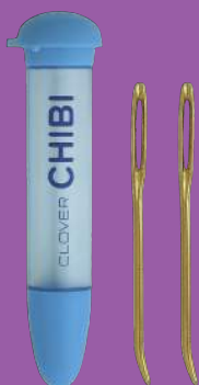
Art No 340

Rnd 1: 6 sc inside magic ring, sl st in first sc (6)