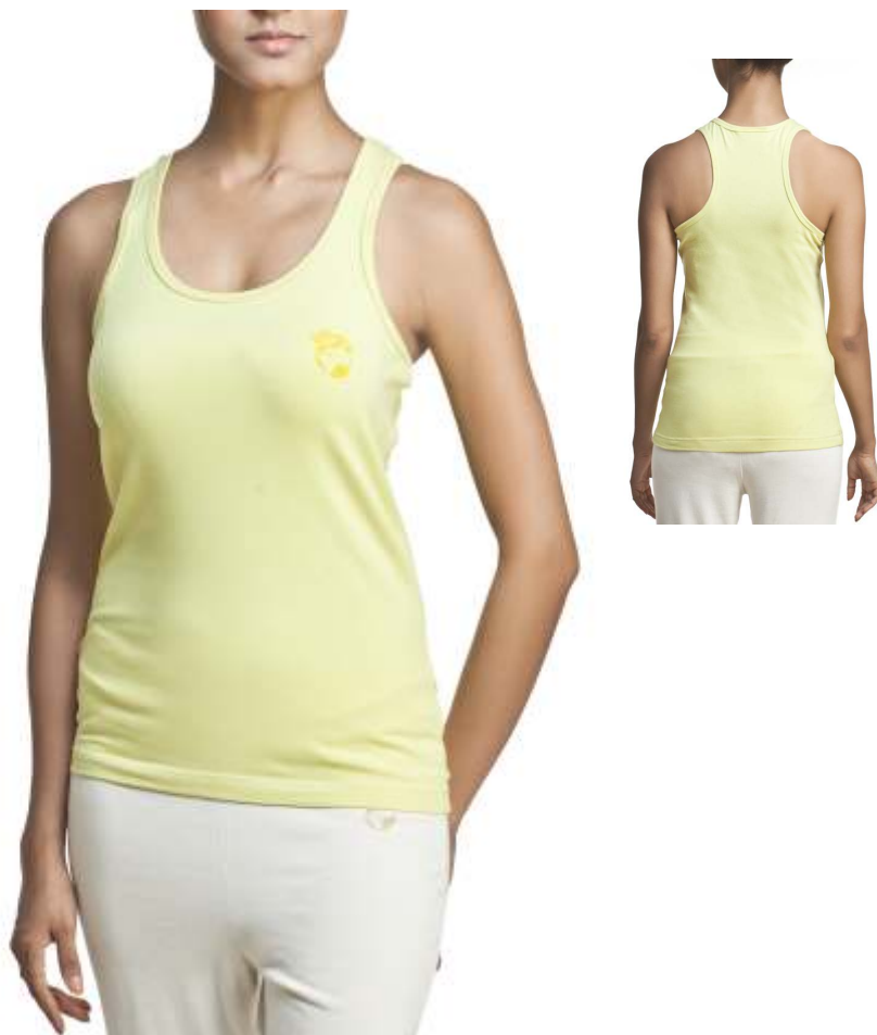
Uttarkashi Yoga Top / DUSG 077

Fabric : 95% Organic Cotton +5% Elastane Jersey Colour : Endive Sizes: M | L|XL | XXL | 3XL