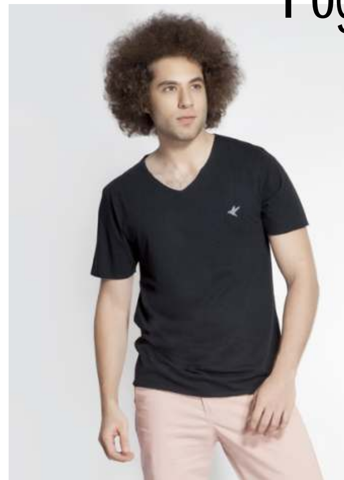
Parvatsana Yoga T / DUSG 119

Fabric : 70% Bamboo + 30% Organic Cotton Jersey