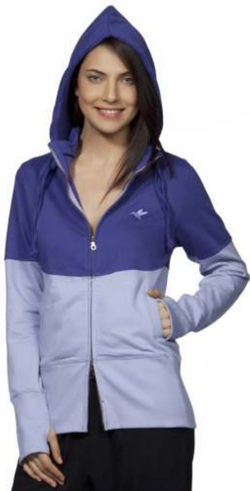
Veronica Sweatshirt / DUSG 128

Fabric : 100% Organic Cotton Fleece Colour : Deep Wisteria Emberglow Sizes: S | M | L|XL | XXL