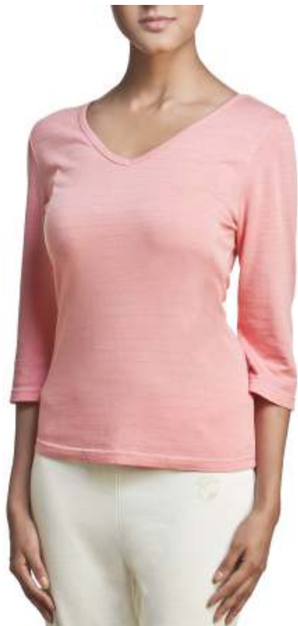
Ananda Yoga Top / DUSG 043

Fabric : 50% Organic Cotton +50% Eucalyptus Jersey Colour : Coral & Natural Sizes: S | M | L|XL | XXL | 3XL