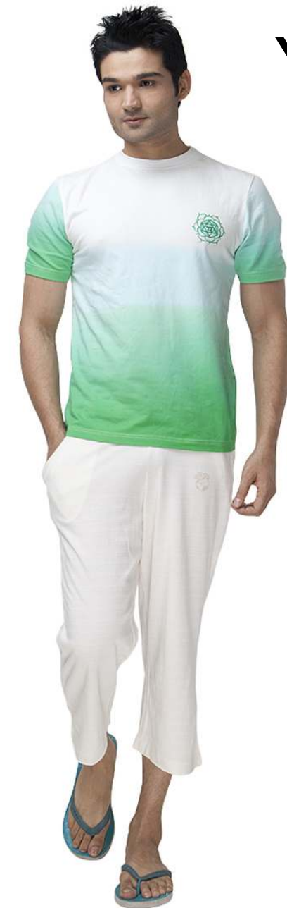
Heart Chakra Yoga T-shirt in Organic Cotton / DUSG 094

Fabric : 95% Organic Cotton + 5% Elastane Jersey