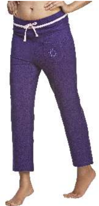
Om Yoga Pants / DUSG 089

Fabric : 95 % Organic Cotton + 5% Elastane Jersey Colour : Grey & Purple Sizes: S | M | L|XL | XXL | 3XL