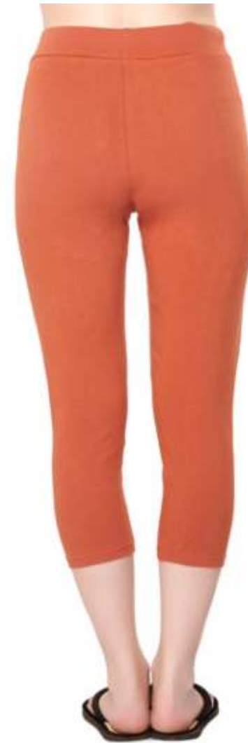
Muladhara Chakra Yoga Capri / DUSG 221