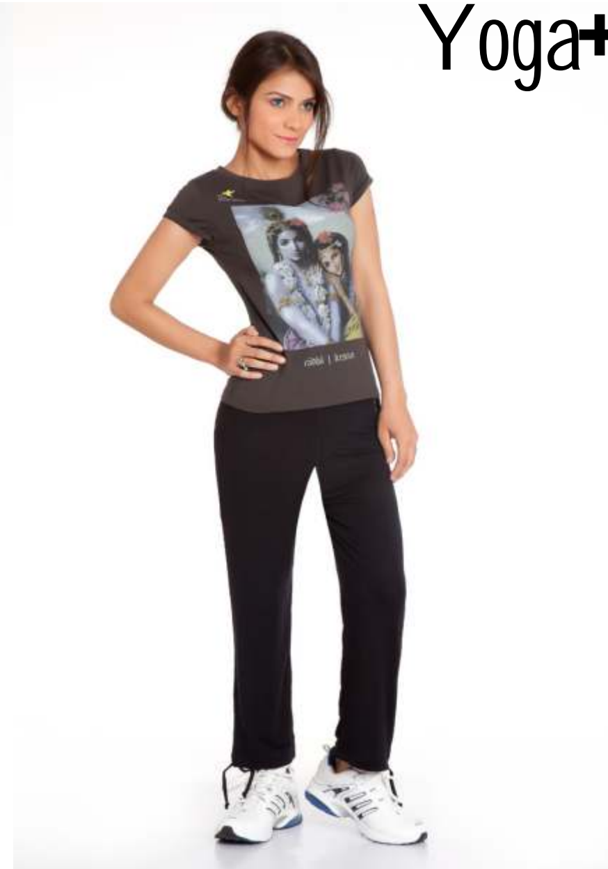
Radha Krishna Top / DUSG 135