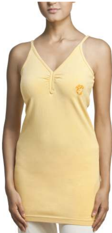
Rishikesh Yoga Top / DUSG 075

Fabric : 95% Organic Cotton +5% Elastane Jersey