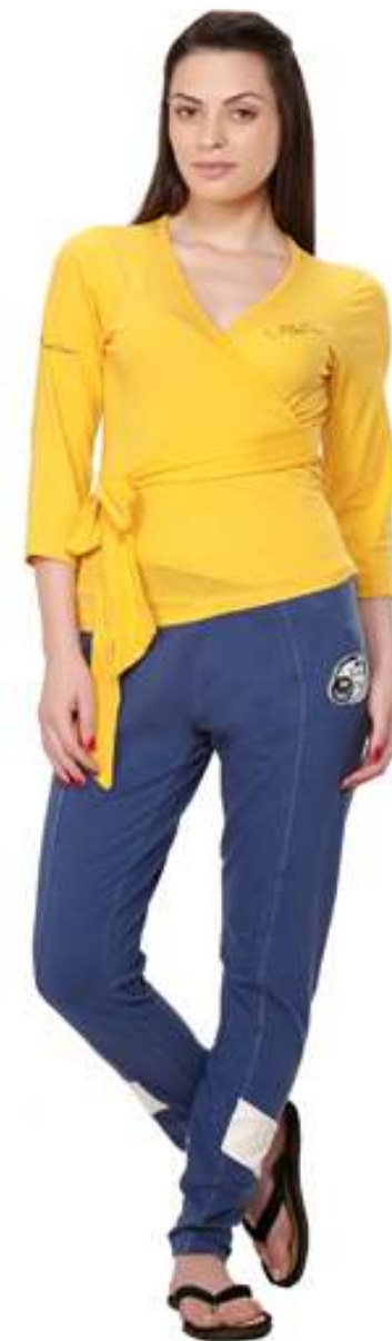
Manipura Chakra Yoga Wrap top / DUSG 216