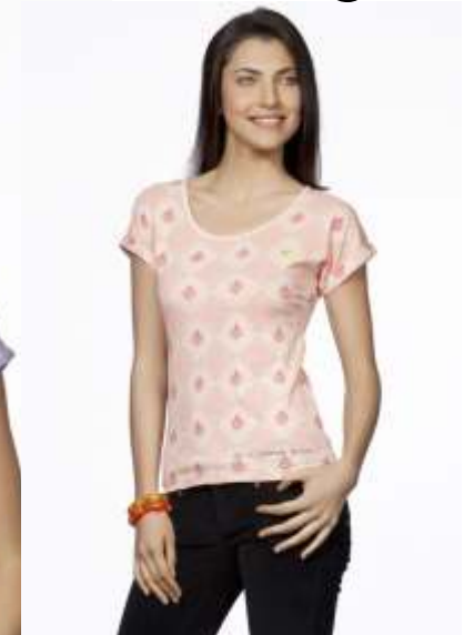
Trikonasana / DUSG 163

Fabric : 100% Organic Cotton Jersey Colour : Soft Peach Orchid Bloom Sizes: S | M | L | XL | XXL