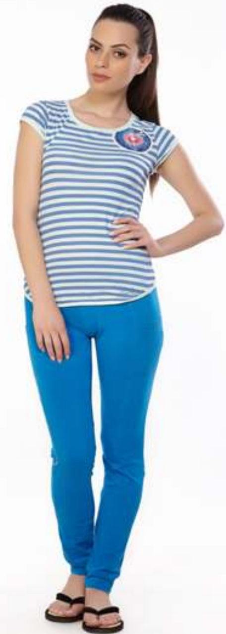
Vishuddha Chakra Yoga Top / DUSG 212