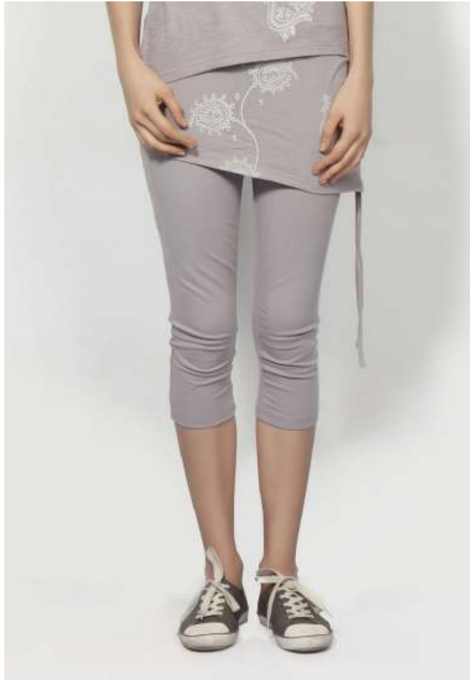
Dhanurasana Yoga Pants with Wrap / DUSG 169

Fabric : 100% Organic Cotton Slub JerseyJersey