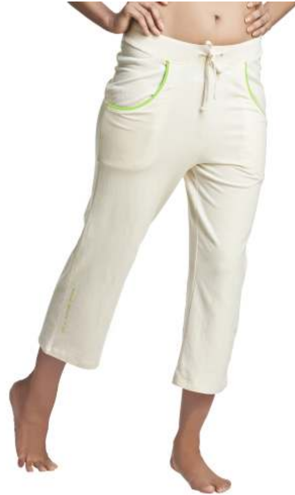
Stillness Yoga Pants / DUSG 091

Fabric : 95% Organic Cotton +5% Elastane Jersey Colour : Beige Sizes: M | L|XL | XXL | 3XL