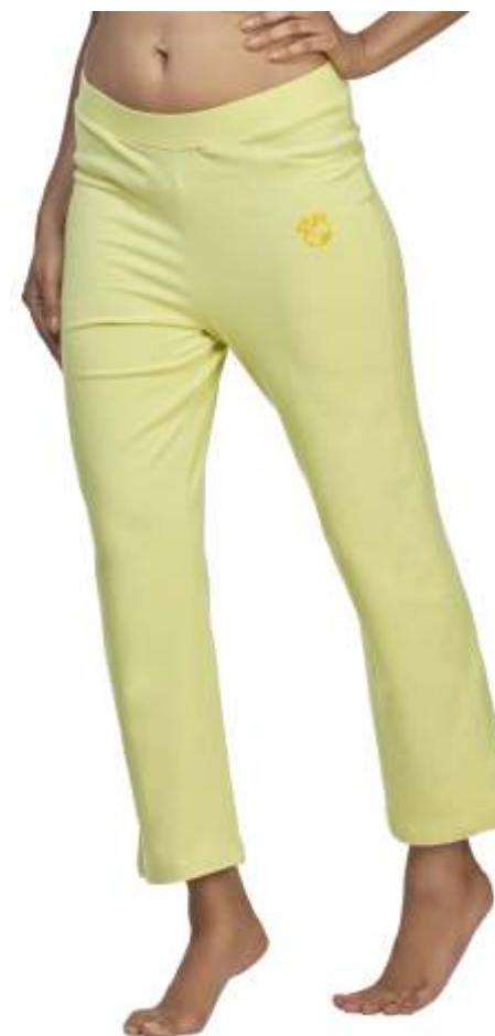
Uttarkashi Yoga Pants / DUSG 078

Fabric : 95% Organic Cotton +5% Elastane Jersey Colour : Endive Sizes: M | L|XL | XXL | 3XL