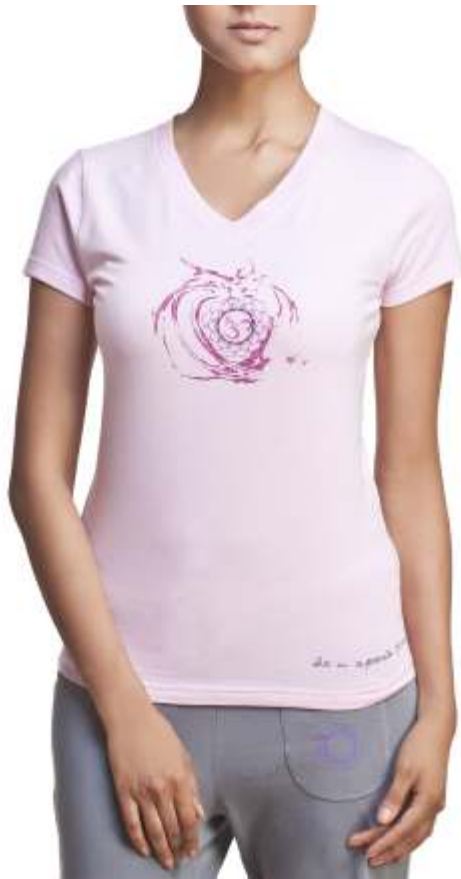
Om Yoga Top / DUSG 088

Fabric : 95% Organic Cotton +5% Elastane Jersey Colour : Pink Sizes: S | M | L|XL | XXL | 3XL