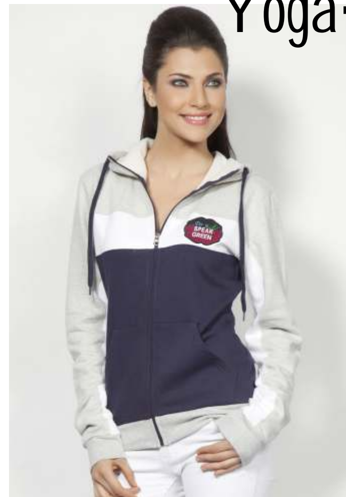
Zermatt / DUSG 187

Fabric : 100% Organic Cotton Brushed Fleece Colour : Urban Chic Sizes: S | M | L