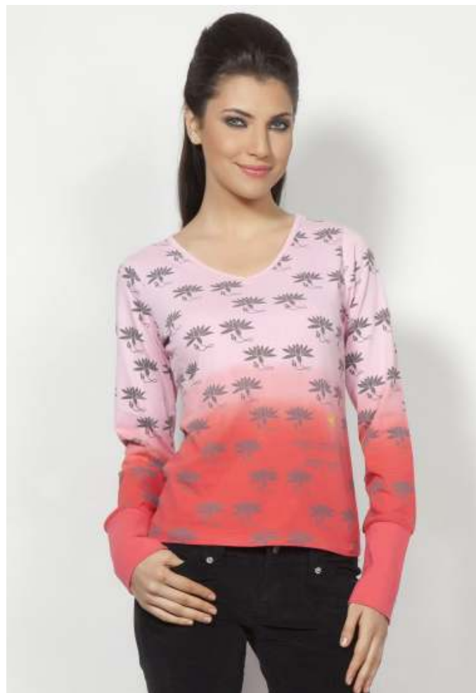
Padma / DUSG 182

Fabric : 100% Organic Cotton Jersey Colour : White Sizes: S | M | L|XL | XXL