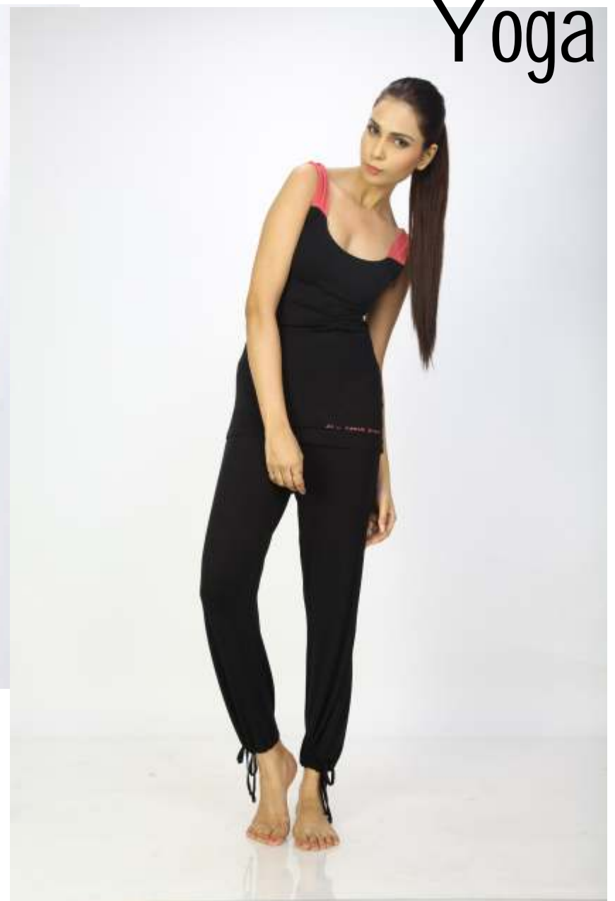
Swara Top / DUSG 134