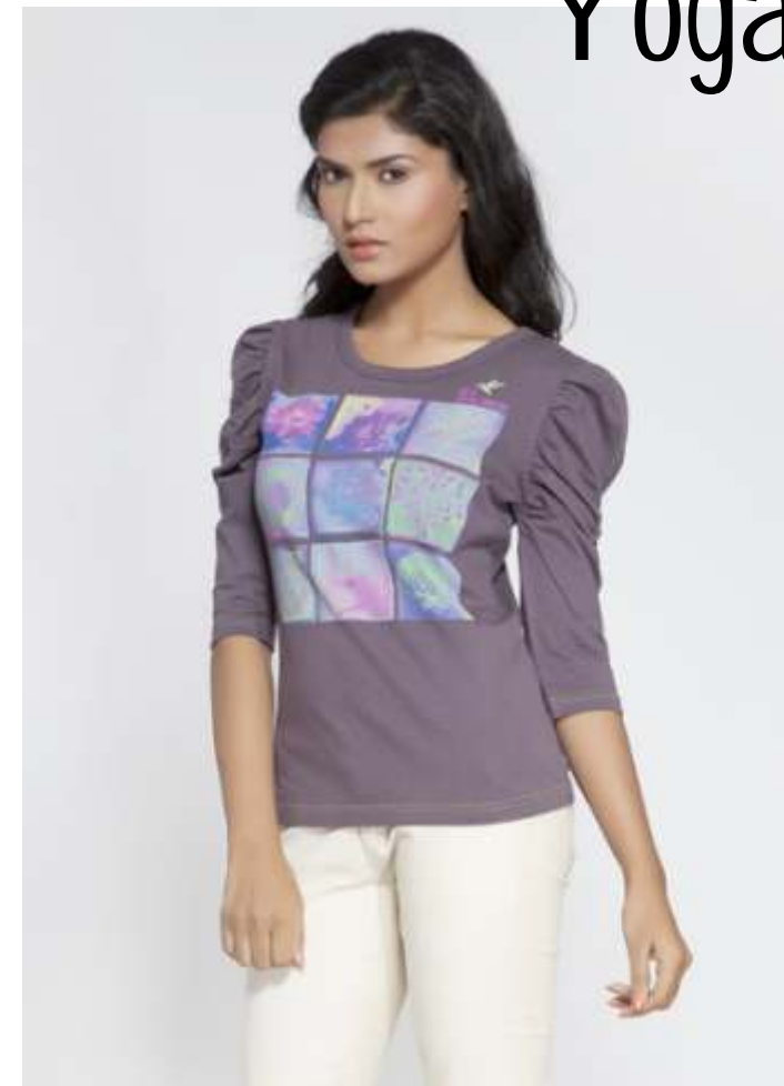
Spiritual Mantra / DUSG 191

Fabric :100% Organic Cotton Jersey Colour : Paradise Pink Sizes: S | M | L|XL | XXL