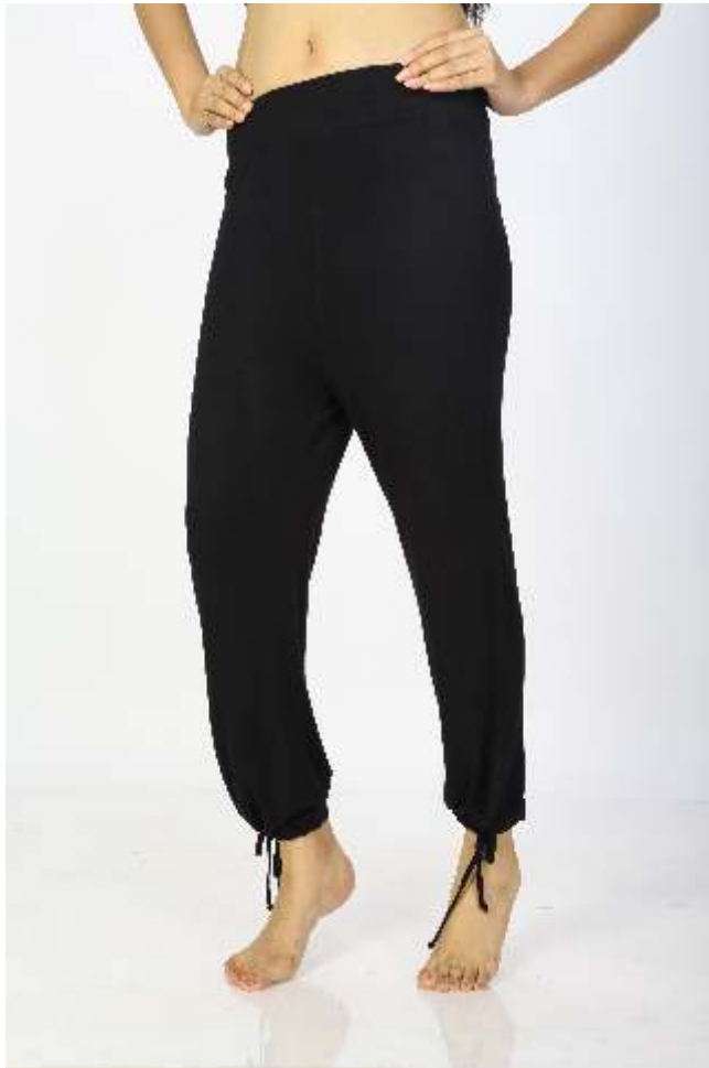
Ashtanga Yoga Pants / DUSG 133