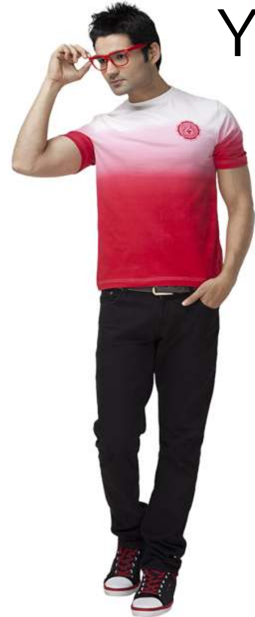
Root Chakra Yoga T-shirt in Organic Cotton / DUSG 094

Fabric : 95% Organic Cotton + 5% Elastane Jersey