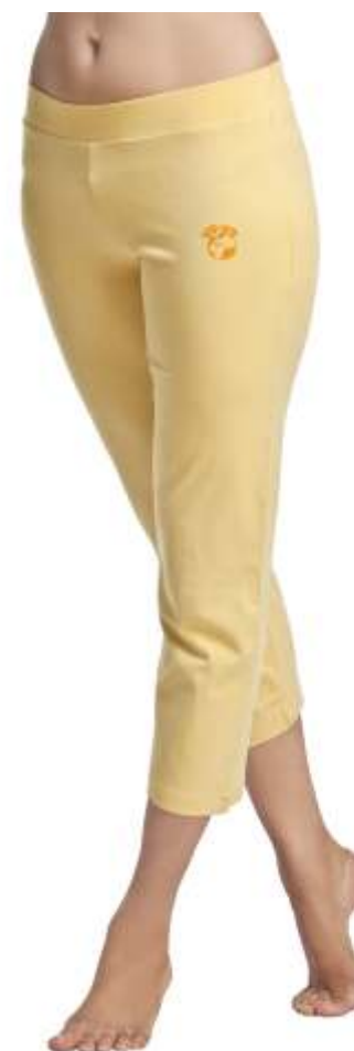
Rishikesh Yoga Pants / DUSG 076

Fabric : 95 % Organic Cotton + 5% Elastane Jersey