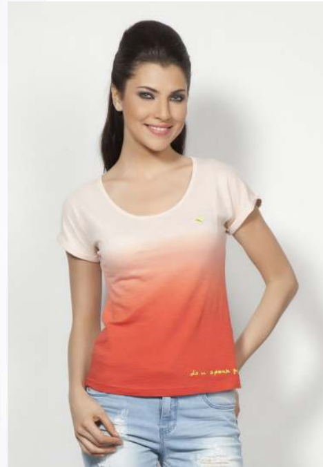
Padmasana Yoga Top / DUSG 162

Fabric : 100% Organic Cotton Slub Jersey Colour : African Violet Linen Sizes: S | M | L | XL | XXL