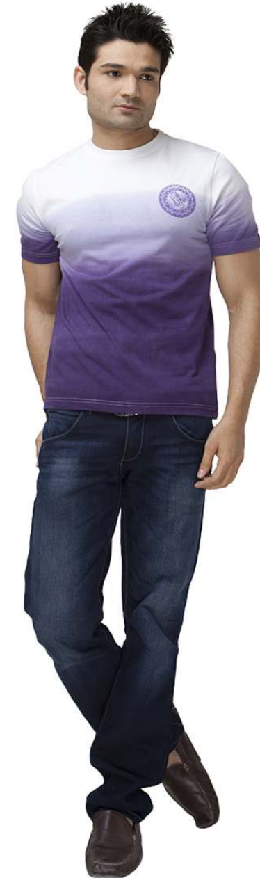
Third Eye Chakra Yoga T-shirt in Organic Cotton / DUSG 094

Fabric : 95% Organic Cotton + 5% Elastane Jersey