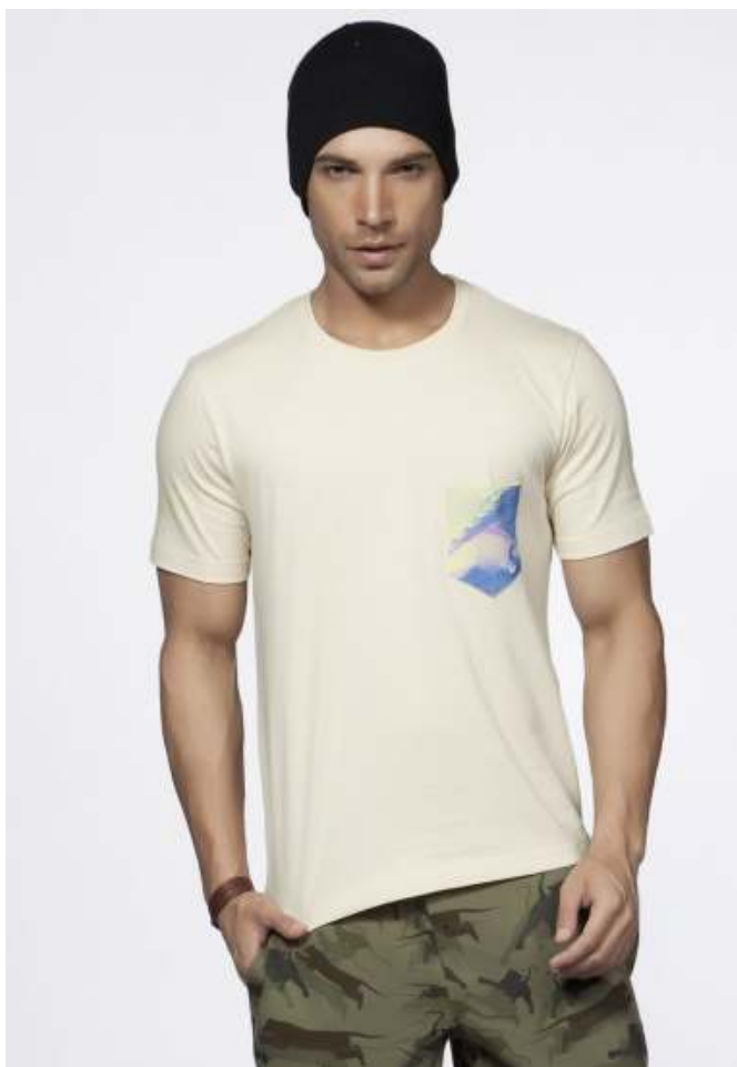
Earth Joy Bee / DUSG 184

Fabric : 100% Organic Cotton Jersey in Natural Dye