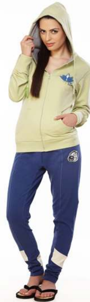
Anahata Chakra Yoga Hoody / DUSG 214