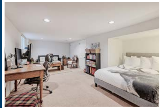
3 + 1 bedroom, 3 bath, meticulously maintained semi in the coveted Silver Birch pocket of The Beach. 2 car parking and a private garden oasis. Steps to Queen and a short stroll to the Lake and Boardwalk.