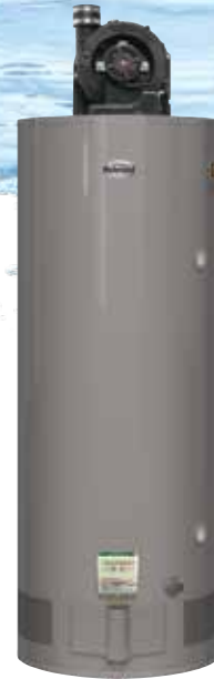
Essential Plus Heavy Duty Power Vent 75-Gallon Capacity 75,100 BTU/h Natural and LP Gas

Safety and Construction | Design certified by CSA: For operation at 160 degrees; meets all safety and construction requirements of ANSI Z21.10.3; as an automatic storage or instantaneous water heater; as an automatic circulating tank water heater; and for operation on combustible floors and in alcove installations. All models are North Carolina Code compliant. Certified for 150 PSI maximum working pressure.