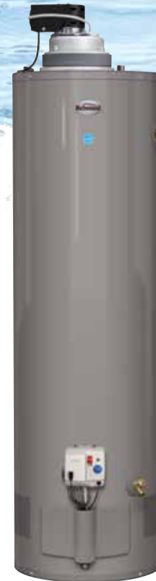
Encore XR90 Induced Draft 29-Gallon Capacity 60,000 Btu/h Natural Gas

Units meet or exceed ANSI requirements and have been tested according to D.O.E. procedures. Units meet or exceed the energy efficiency requirements of NAECA, ASHRAE standard 90, ICC Code and all state energy efficiency performance criteria.