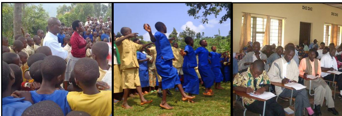
Photos (left to right): Education in schools, Children dancing, Training of ANICOs