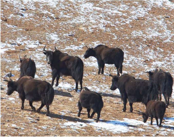
Fig. 5. —Wild yak ( Bos mutus ) adult females and calves in Yeniugou, central Qinghai, China.

males advancing to reconnoiter” (Przewalski 1876:190; Rawling 1905; Schaller 1998).