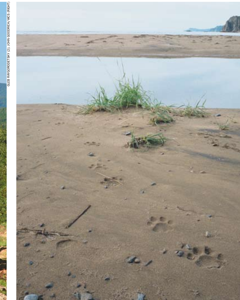
GLEB RAYGORODETSKY (2); JOHN GOODRICH/WCS (RIGHT)