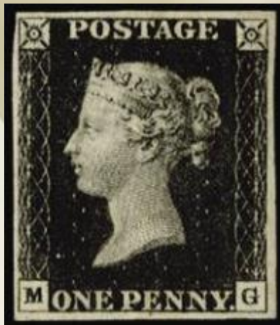
1840 Penny Black (plate 7)