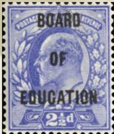
1902 Official 2½d Board of Education