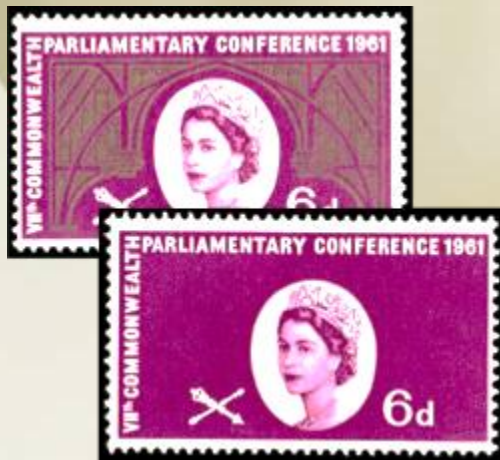
1961 6d Parliament (gold omitted)