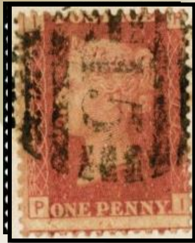
Queen Victoria 1904 6d IR Official Penny Red (Plate 77) unique in private hands £579,000 £550,000