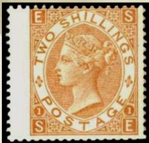
1880 2 shillings Brown