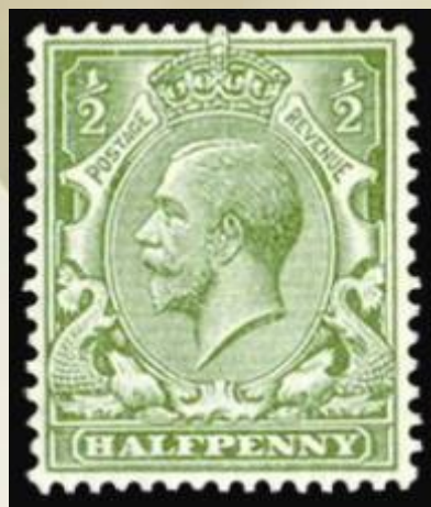
1914 1/2d Cyprus Green