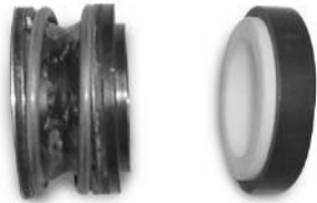
AS-360 Purex C Series #P28175