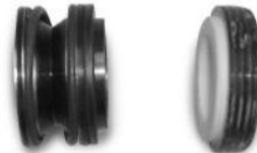
AS-1521 Use AS-201 Baker Hydro 35B1109 Hayward SP-1600-Z-2 Super Pump Marlow 38592 Sta Rite U-109-372