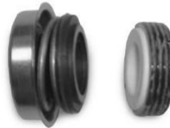
AS-1000 American Americana II, Maxim, Power Glas, Ultra Flow, 397012, 397020 American Eagle 397012, 397020 Ampro Dura-Flo, Noryl Turbo, XL600, 304 Anthony 04380 Aqua Flo A,B,C,D Series 92509040/92500050, Dominator High/Med Head (Pre 1995) Doughboy 1128-1006, 306-1002 Martec 300-009, 310, 108, Polaris P-55 Premier 31-8113 220/225 Series Pre 1988, 300 Series Pre-1988, 455/456 Series, 500 Series, 600 Series Purex P-28050, P-28323/71734 Whisperflo Sta Rite U-109-136-SS, HF, HFA, HP, CF, CFA, BPA