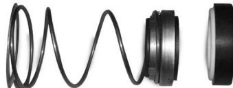
AS-774 Sta Rite U-109-170 O-Ring Style