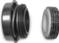
AS-601 Acura Spa 1090-A Maqnaflow, Aquaheat Supercharger Jandy HHP-HHPU, MHP-MHPU R0338200