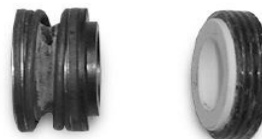
AS-4702 Use AS-200 Baker Hydro 35B1138 Doughboy 306-1006 Hayward SP-1500KA Powerflo pump Kit -O- ring (0-303) and seal housing