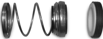
AS-361 Jacuzzi 10143402