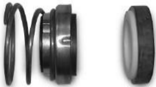
AS-380 Sta Rite 3 & 5 hp D pump U-109-47