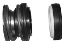
AS-910 Sta Rite