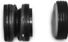
AS-501 Purex P-28322 Aquatron