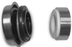
AS-411 Marlow 2AF Series, 25353 EC-B, EC -A2 Marlow 26661Z, 26469-2