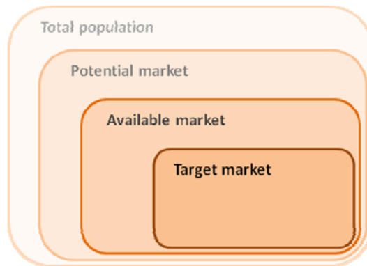
Figure 2: Selecting the target market