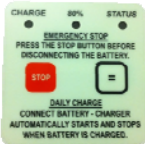
Standard control P46-266