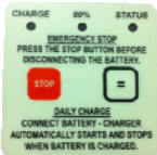
Standard control P46-266