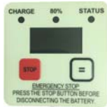
Optional: P46-267 LED display with status indicator.