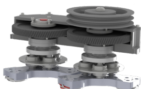
Robust gears to drive tool plates