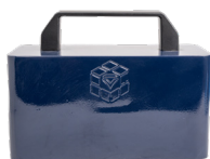
30lb front weight