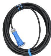
75 feet of 8 gauge extension cord