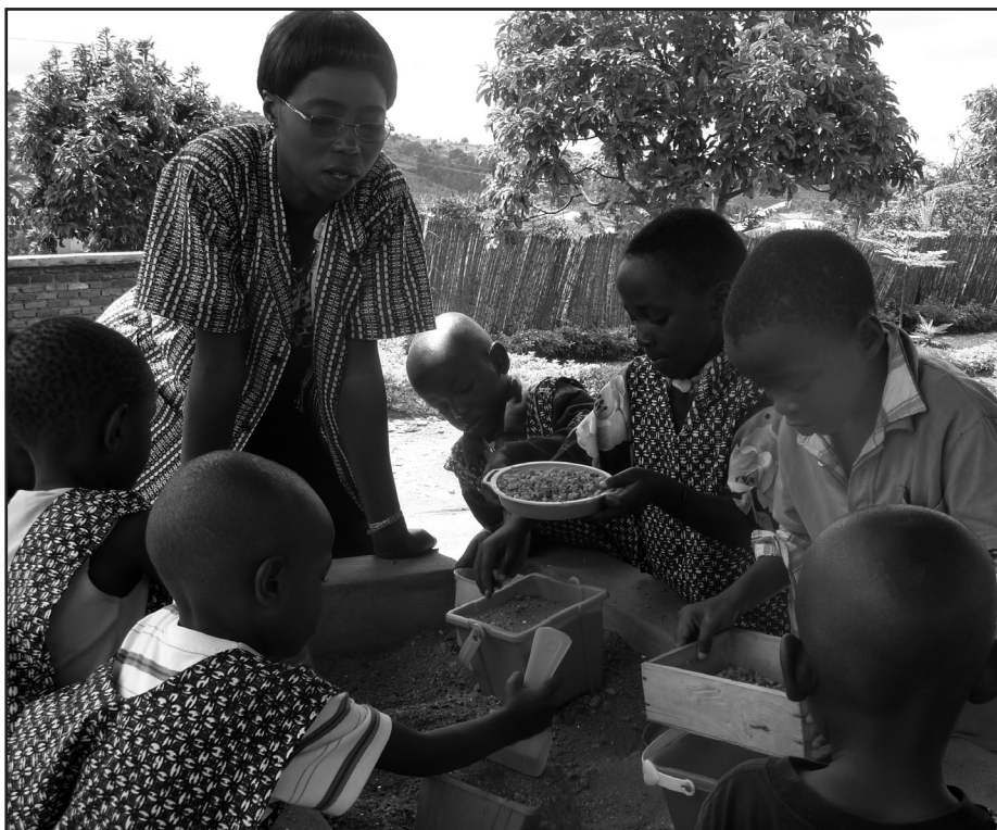
Subjects & Predicates

Set up a science area or discovery center for children to explore items from nature such as leaves, rocks, shells, worms; or science materials such as magnets and magnifiers. Provide a variety of items for young children to explore with their senses.