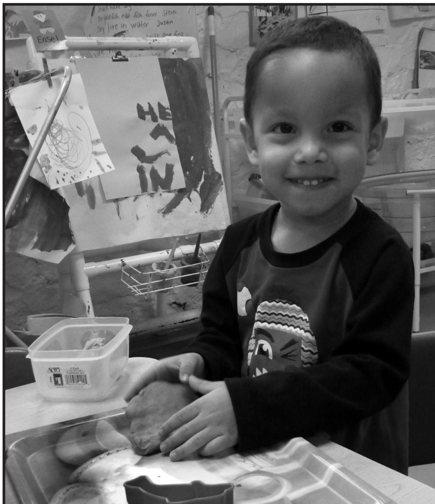
Subjects & Predicates

The fundamental process skill of observing can be defined as using the senses to gather information about objects or events. High-quality early childhood classrooms contain many opportunities to observe things closely. The National Association for the Education of Young Children requirements for accreditation include that each classroom contain