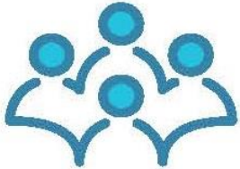
NSTA conferences and workshops

In addition, each teacher in the cohort gets discounts on: