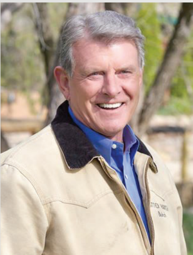
GOVERNOR C.L. "Butch" Otter

Endorsements are current as of mailing date.