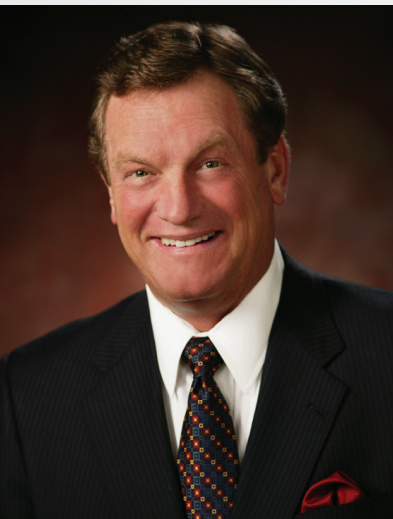
U.S. HOUSE District 2 Mike Simpson