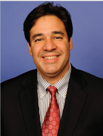
U.S. HOUSE District 1 Raul Labrador