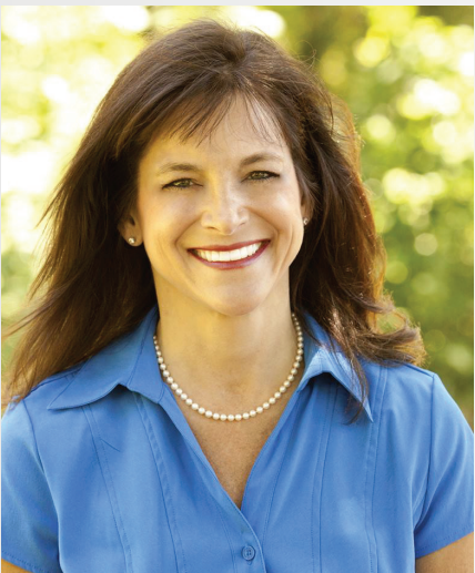
U.S. SENATE Monica Wehby