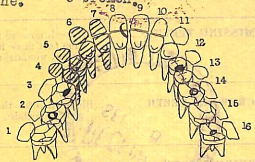
Diagram represents the mouth wide open.

(e) Permanent marks on body (old scars, peculiarities, or missing parts) do