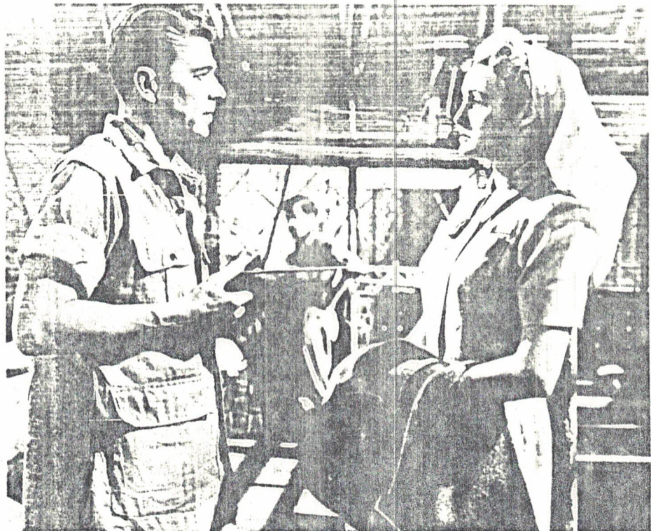
* With Reagan again, The Hasty Heart .

(11.20.46) at the Fulton Theatre, and more than one critic hailed her as "a young Tallulah Bankhead" (who had created the part of Regina in Foxes ). "She came backstage to see me," says Neal, "and said, 'Dahling, you were as good as I was — and if I said you were half as good, it would have been a hell of a compliment!'"