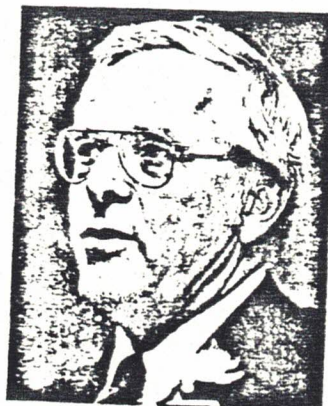
Rep. Stan Parris, R-Va.