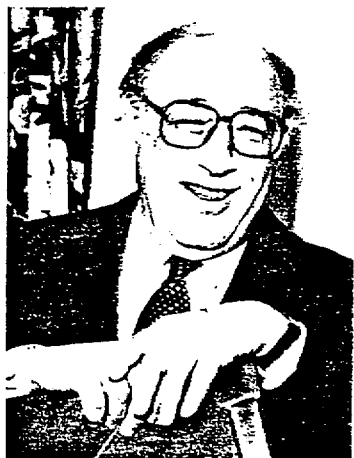
Fred W. Friendly

good Marshall. I want a promise from you that there will be a black member of the Supreme Court.