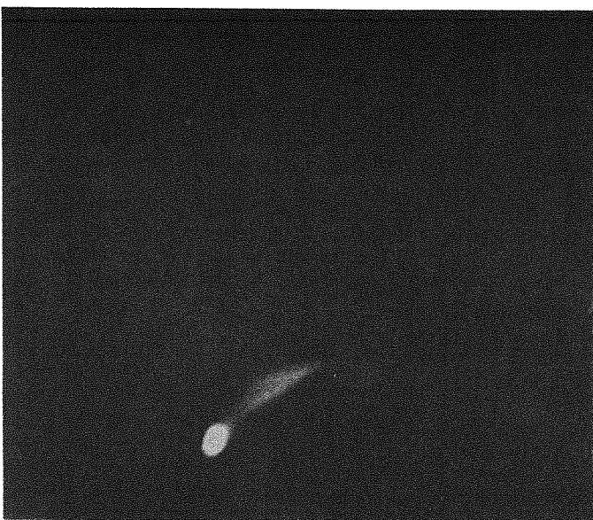
PHOTO NO. 1 UFO Sighted by Astronaut McDivitt