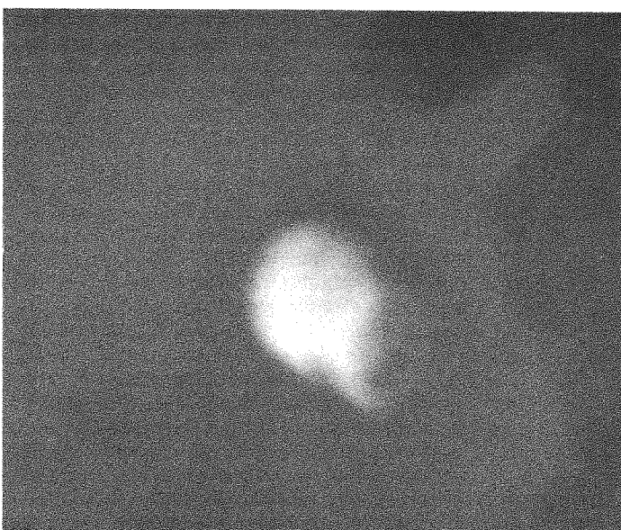
PHOTO NO. 2 Unknown Photographed from Gemini 11