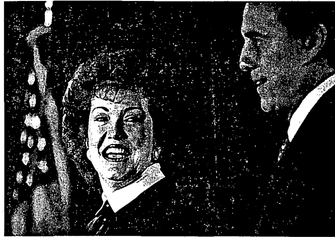
The Doles at her swearing-in: no collusion between the branches