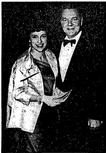
FROM "WASHINGTON THROUGH A PURPLE VEIL" Lindy and Hale Boggs at the White House in 1962.