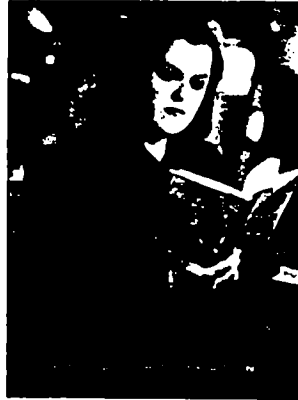
ROSIE THE READER: Celebrities will help front and center.

At this year's annual meeting, the AAP revised its dues structure, establishing a flat membership rate of $195 for publishers with annual sales under $1 million; and a simplified rate of $1