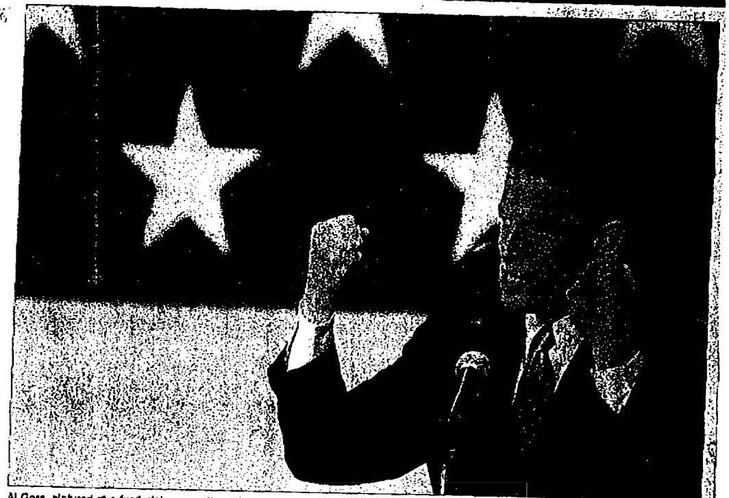
Al Gore, pictured at a fundraising reception this week, has suffered a rebuff from Friends of the Earth