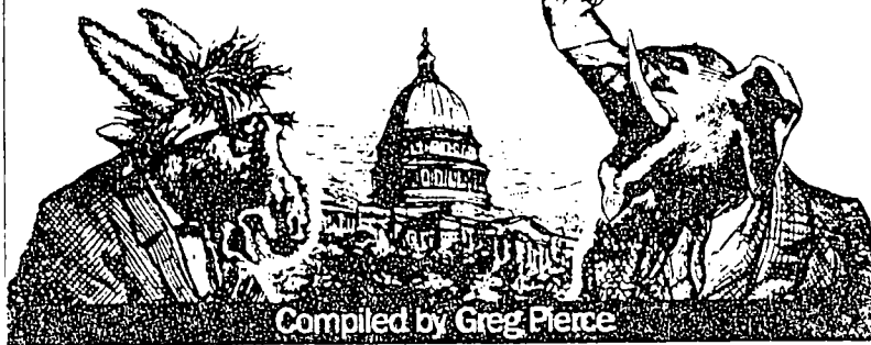
Compiled by Greg Pierce

"At the heart of CBO's 'potency' is our reputation for providing objective, nonpartisan analysis. The Journal's editorial is one long harangue for 'rosy scenarios' and politicization of the agency."