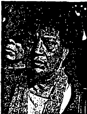
LEADER Evers-Williams wants to hold the line.