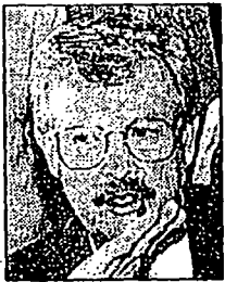
Hogue: 'It's going to be very difficult'

seven states will come under the same restriction, including 67 of 110 House members in Michigan and 50 of 100 in Arkansas. And the number will grow in future years, as term limits in more states take effect.